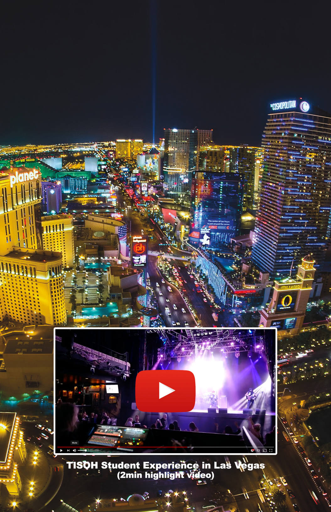
TISQ Student Experience in Las Vegas (2min highlight video)