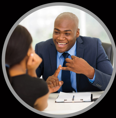
marketing & sales